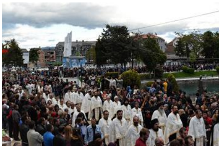
20. Bigorski Monastery