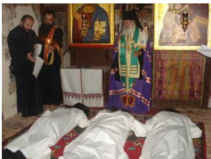
12. Zrze Monastery