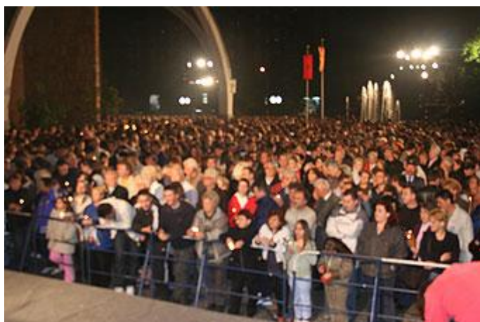
9. Easter in the Cathedral Church in Skopje