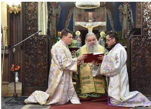
23. Faculty of Orthodox Theology and church St. John Baptist