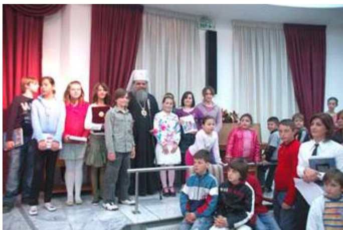
8. Easter in the Cathedral Church in Skopje