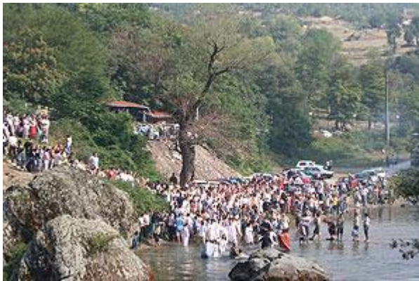
14. Stavropigial Monastery Kalishta