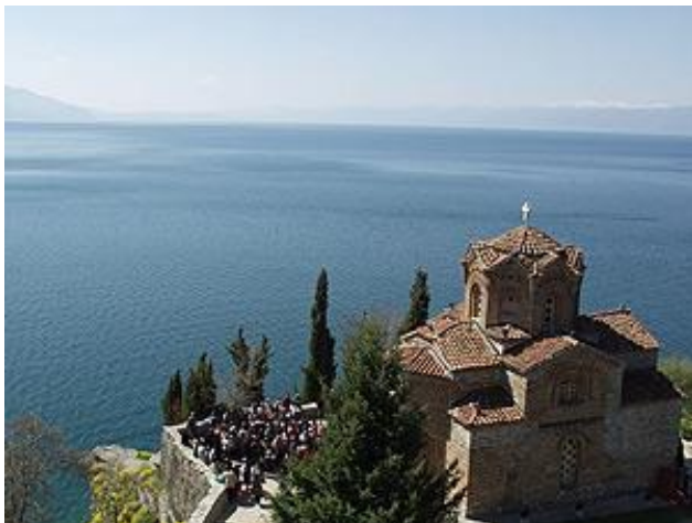
18. Monastery of St. Clement of Ohrid, Plaosnik