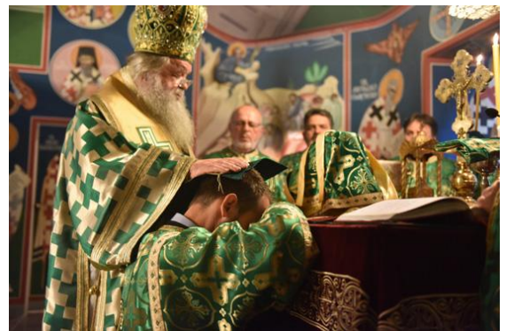
25. Procession at the Feast of the Nativity of Virgin Mary