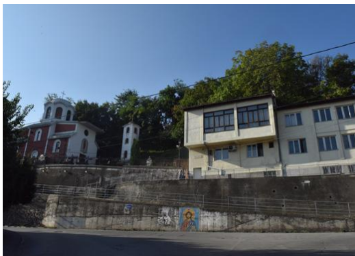
23. Faculty of Orthodox Theology and church St. John Baptist