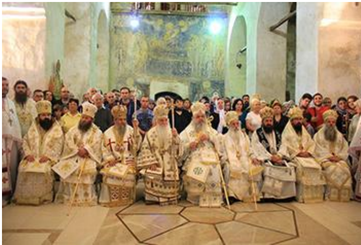
17. St. John Theologian, Caneo – Ohrid