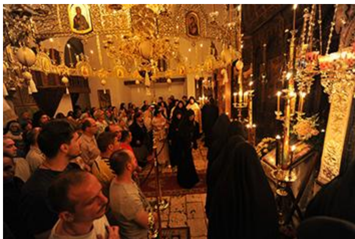
21. Cathedral Church in Skopje, St. Clement of Ohrid