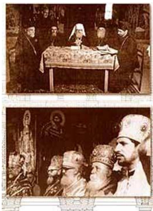
2. Dositej, Archbishop of Ohrid and Macedonia, first Head of the renewed Macedonian Orthodox Church